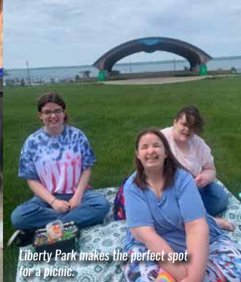
Liberty Park makes the perfect spot for a picnic.