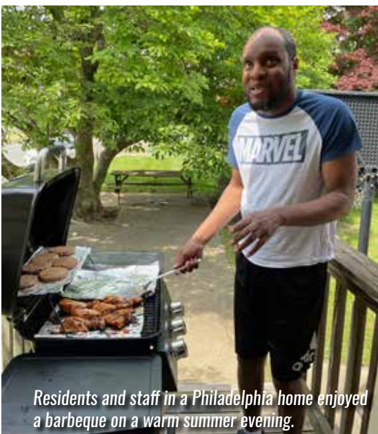
Residents and staff in a Philadelphia home enjoyed a barbeque on a warm summer evening.

Adults in residential group homes in Erie, Philadelphia and Pittsburgh have been heading out – and staying in – to enjoy many of the fun activities of summer. Picnics, yard games and visits to favorite spots have been keeping everyone busy and in a summertime frame of mind!