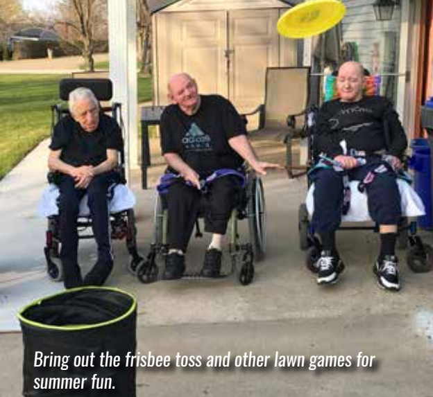
Bring out the frisbee toss and other lawn games for summer fun.