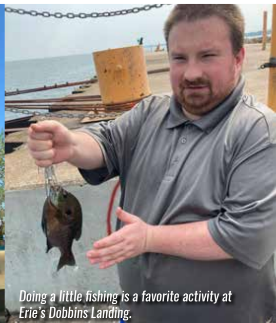
Doing a little fishing is a favorite activity at Erie’s Dobbins Landing.