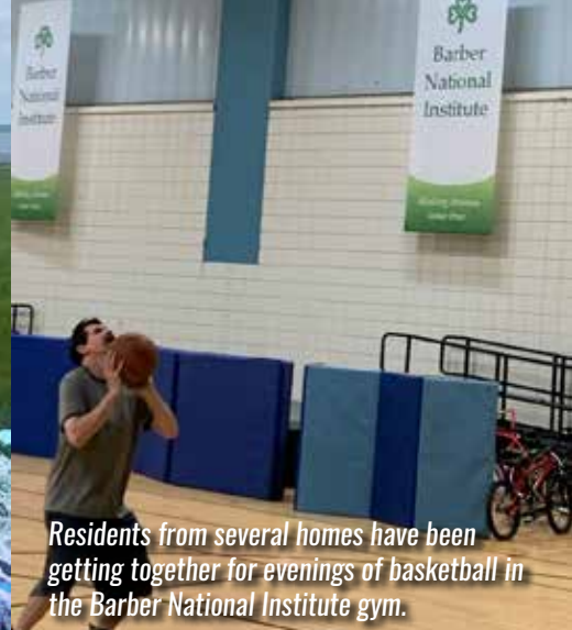
Residents from several homes have been getting together for evenings of basketball in the Barber National Institute gym.